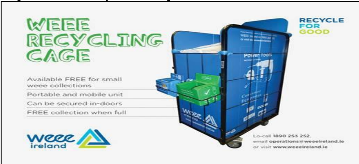
Image of WEEE & Battery Waste Storage

A battery box and a WEEE Bin shall also be provided in the communal waste storage areas, an example of which is shown in the following image. This shall be managed by a specialist waste contractor who will be responsible for its routine collection.