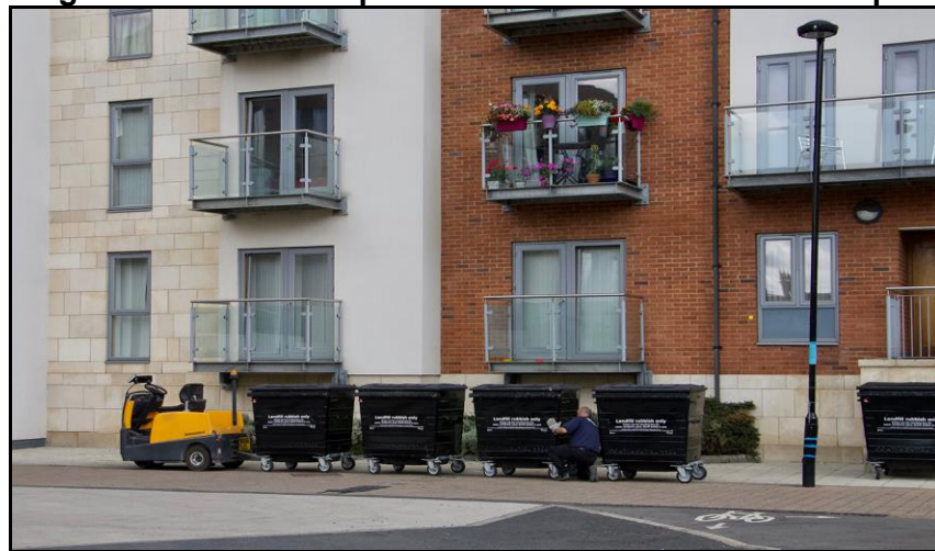
Image of Bulk bin transport from bin stores to collection point