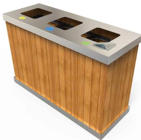
Image of a typical internal communal space waste segregation recycling system

Colour coded and clearly labelled waste bins for plastics, paper & cardboard, organic materials and non-recyclable general waste shall be installed in communal areas/rooms for easy and clear segregation by residents, an example of which is shown below.