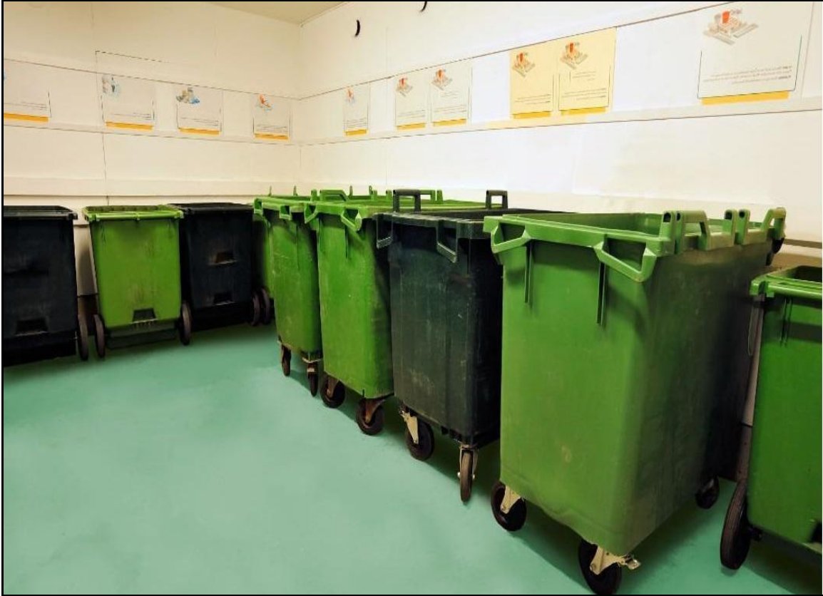
Image of a typical communal waste storage area

A battery box and a WEEE Bin shall also be provided in the communal waste storage areas, an example of which is shown in the following image. This shall be managed by a specialist waste contractor who will be responsible for its routine collection.